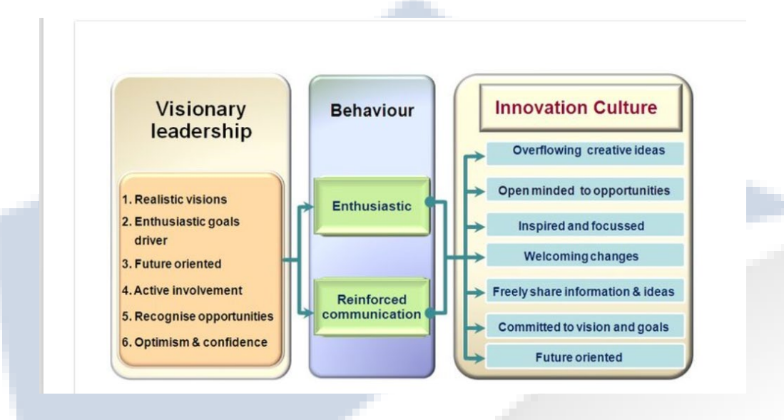
Figure 3. A model of creating innovation culture through visionary leadership

According to Yan, Maladzhi & Makinde (2012), leadership plays a critical role in creating a culture of innovation in organizations. The researchers aimed to develop an innovative model by applying the key characteristics of visionary leadership to create a culture of innovation in Small and Medium Enterprises (SMEs).