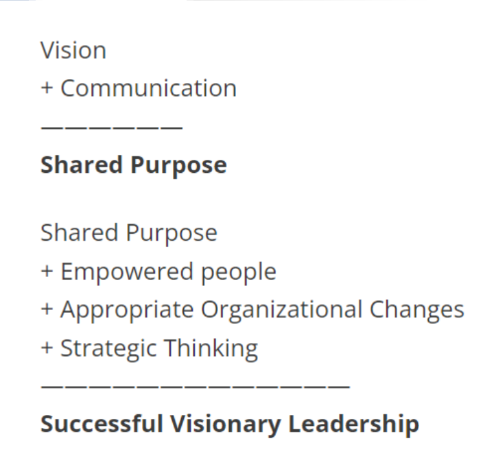
Figure 2. Successful Visionary Leadership

A new direction should inspire a mid-level leader to seek out new opportunities.